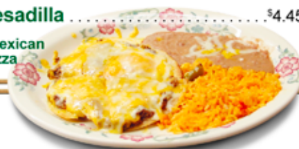
Mini Mexican Pizza