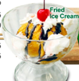
Fried Ice Cream