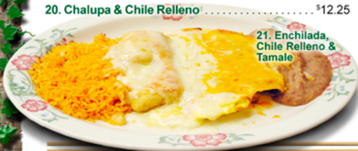
21. Enchilada, Chile Relleno & Tamale