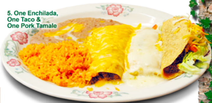
5. One Enchilada, One Taco & One Pork Tamale