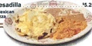
Mini Mexican Pizza