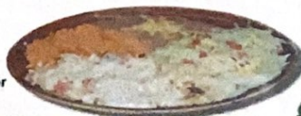
Puerto Vallarta Platter

Real crab meat, prawns, chicken, onions and mushrooms sauteed in wine, then topped with Monterey Jack and Cheddar cheese, and baked. Served with Mexican rice and refried beans, cholesterol-free beans "De la olla" and two flour corn tortillas. *16.50